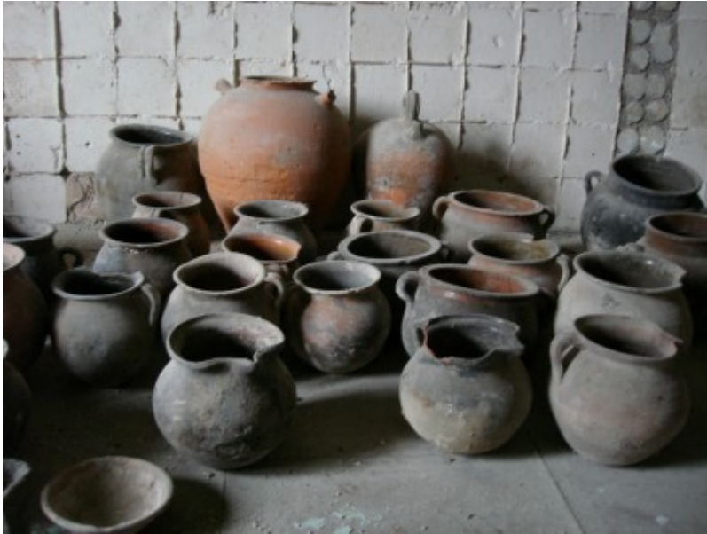
Pottery sample from the historical building “Casa de la Convalescència” in Vic, Barcelona.

Specifically, this thesis considered ceramics with brown decorations of iron and manganese, with particular attention to ceramics of the type à taches noires from the Provençal site of Jouques and common ware from the archaeological works made in the historical building “Casa de Convalescència” in Vic (Barcelona).