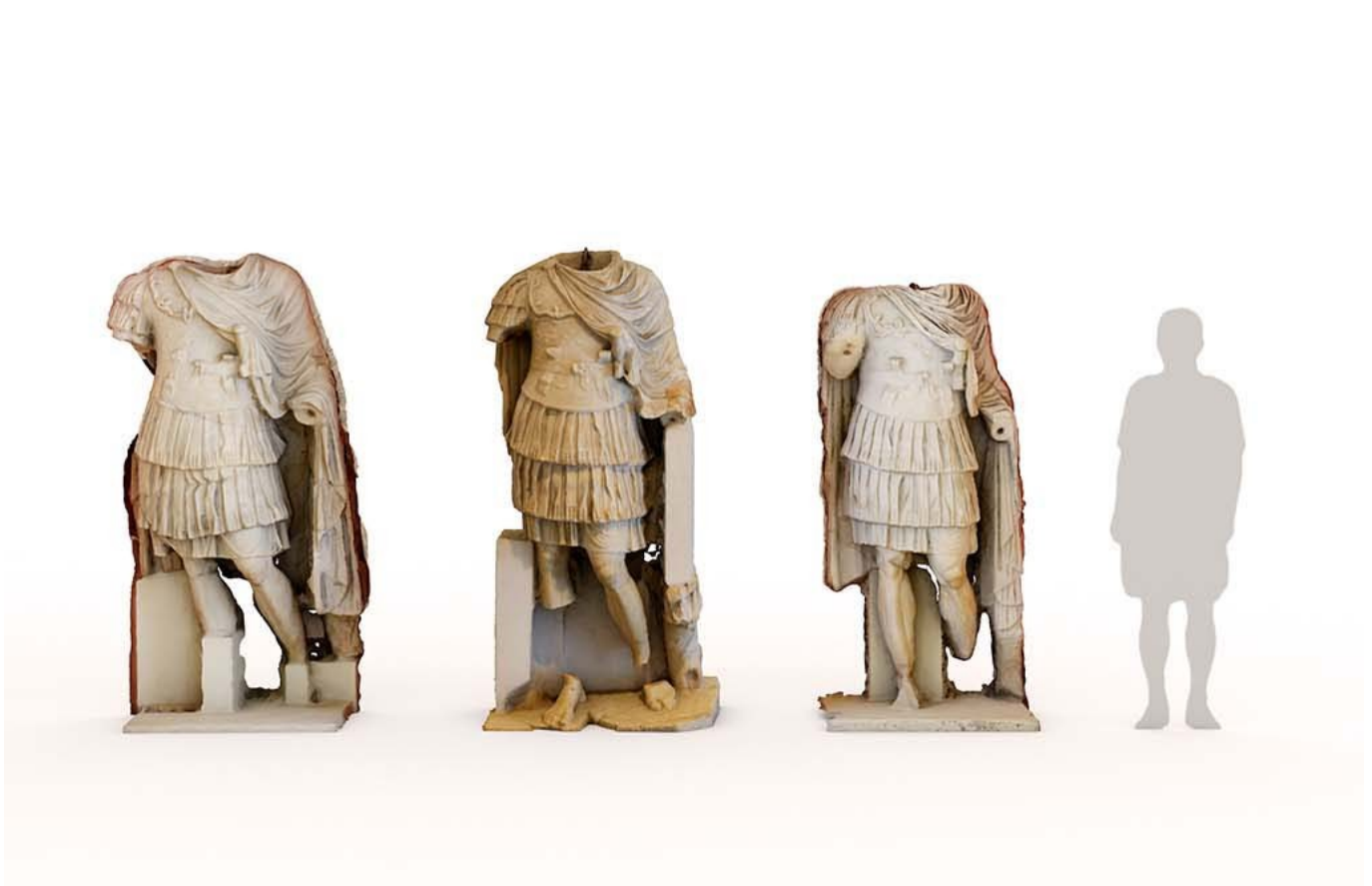
Set of sculptures recovered from the theatre's surroundings

Points of interest: Altar dedicated to the imperial cult, Marmorization, Sculptural cycles, Rear façade, Façade of the stage, Architectural orders, Ninfeo, Tribunes, Radial walls, Preserved remains, Velum .