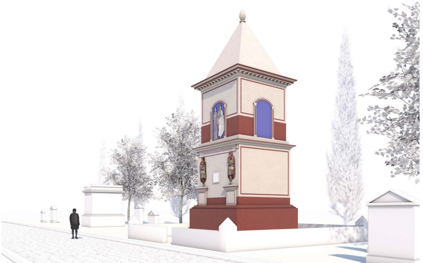
Scipio tower @ SETOPANT

Points of interest: Architecture, Attis, Monumental inscription, Missing inscription, Bas-relief.