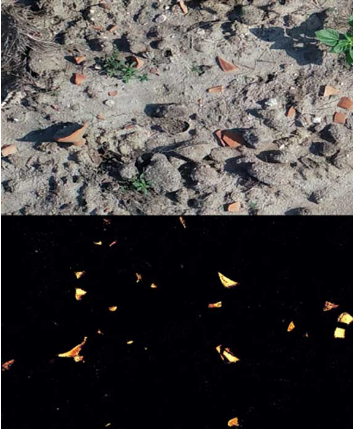
Upper image showing a drone-acquired image of the ground. Lower image showing the sherds detected by the machine learning algorithm (Hèctor A. Orengo & Arnau Garcia-Molsosa)