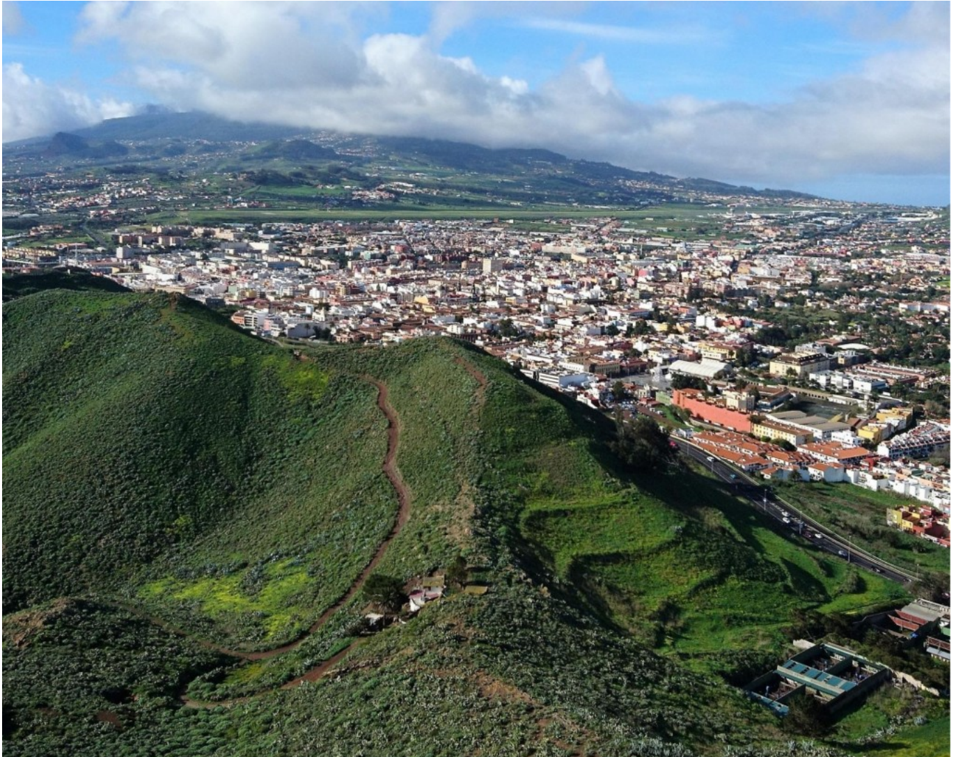
View of San Cristóbal de La Laguna from a historical beacon station.

“For centuries, the beacon signalling network was the island’s first line of defence against pirates, privateers or Crown enemies. People who worked as watchmen were shepherds and farmers, and they kept their agro-pastoral activities while on duty. As a result, many beacon locations are associated with impressive ethnographic remains such as huts and terraces. Therefore, we are studying the early configuration of Tenerife’s cultural landscapes in colonial times”, concludes Jared Carballo (ULL).