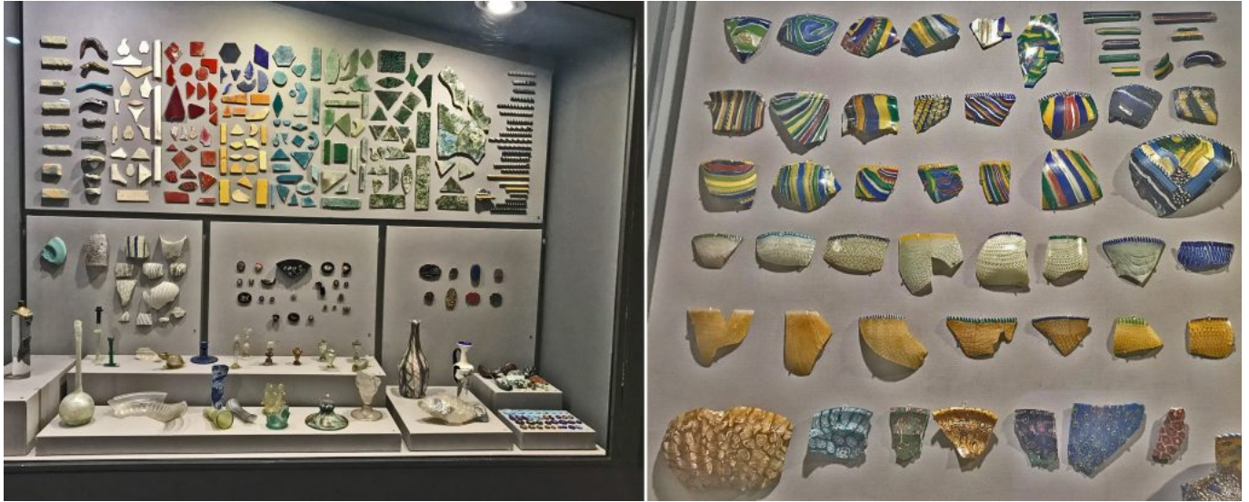
Some coloured glasses from the Gorga Collection hosted at the Museo Palazzo Altemps in Rome.

In the last years, a deep study of Gorga glasses allowed to locate similar materials in museums and collections around the world such as the Museo del Vetro (Venice, Italy), the Victoria & Albert Museum , and the British Museum (London, UK), the Corning Museum of Glass (Corning, New York), the Metropolitan Museum of Art (New York), the Toledo Museum of Art (Toledo, Ohio) and the Sangiorgi and Morgan Collections.