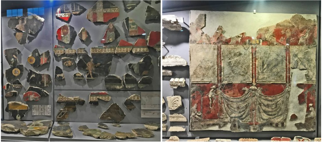
Panels with figurative and decorative elements from the Gorga Collection hosted at the Museo Palazzo Altemps in Rome.

The main purpose of this project is to characterize, from a technological point of view, monochrome and polychrome glass sectilia that replicate precious marbles and rare stones coming from the Gorga collection.