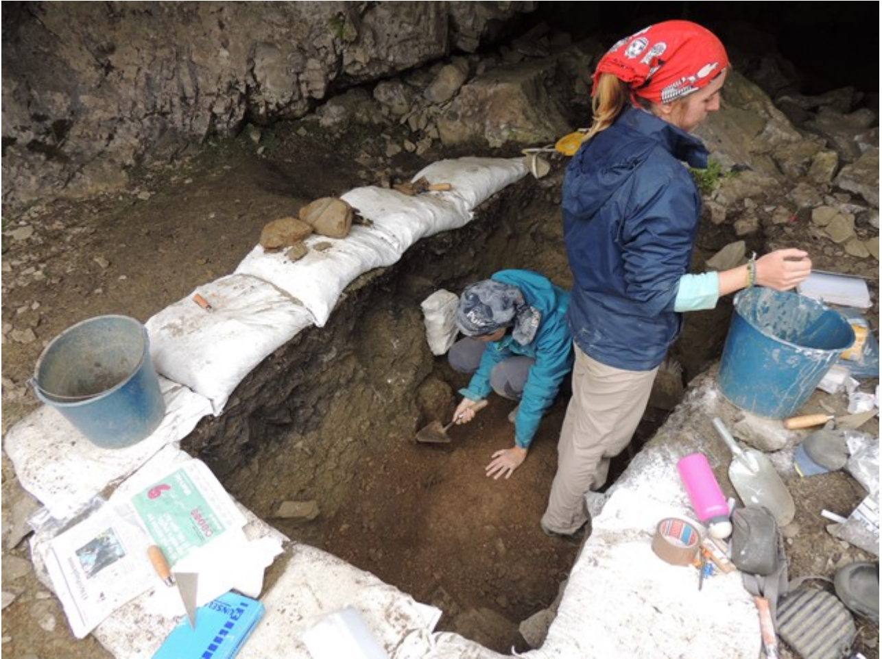
Geo-archaeological work in the prehistoric cave of 'Catau de l'Os' ('Forat de l'Embut', Queralbs, Ripollès).