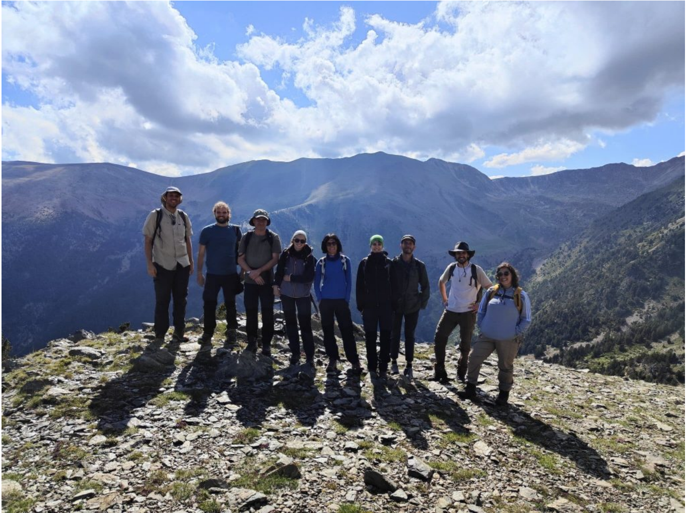
A group of GIAP members is excavating at the Coll de Molleres I archaeological site since Sunday, July 7.

ICAC-CERCA collaborates with this and other local entities to ensure the transfer of knowledge from its research and the enhancement of the cultural landscape heritage, especially through the European project Interreg Sudoe Cultur-Monts , which aims to be a resource for sustainable territorial development and tourism.