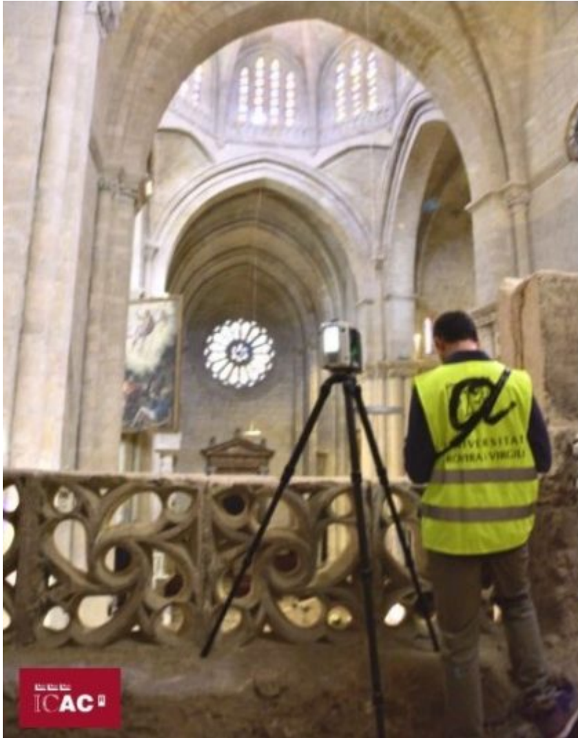
catedral maig 2024 (2) - 1