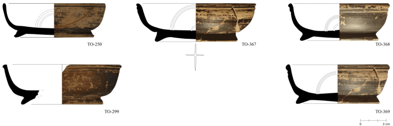
Figure 41. Bowls of Lamb. 1 / F2320, 2361 of late Campanian B Calena ceramic.

For more information, please contact ICAC Publications through our website or follow us on social media (@ICAC_cat / @icac_cat) for updates on our publications.