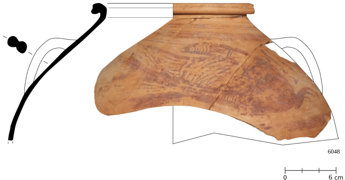
Figure 18. 6048: ovoid-bodied jar with twin vertical handles, decorated with a figure of a bird with spread wings and turned head.