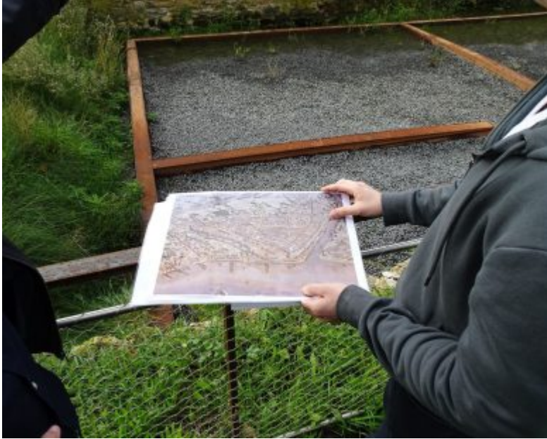
Visit to the archaeological remains at Lattara (Musée Henri Prades, Lattes, Hérault)

This research visiting was made possible thanks to a mobility grant from the Spanish Ministry of Science, Innovation, and Universities . The grant is aimed at FPU program researchers to complement their academic training.