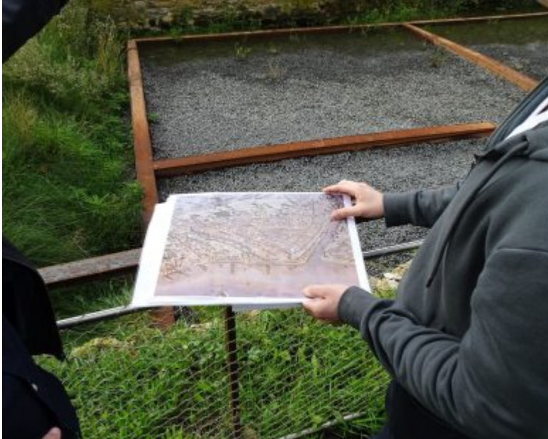
Visit to the archaeological remains at Lattara (Musée Henri Prades, Lattes, Hérault)

This research visiting was made possible thanks to a mobility grant from the Spanish Ministry of Science, Innovation, and Universities . The grant is aimed at FPU program researchers to complement their academic training.